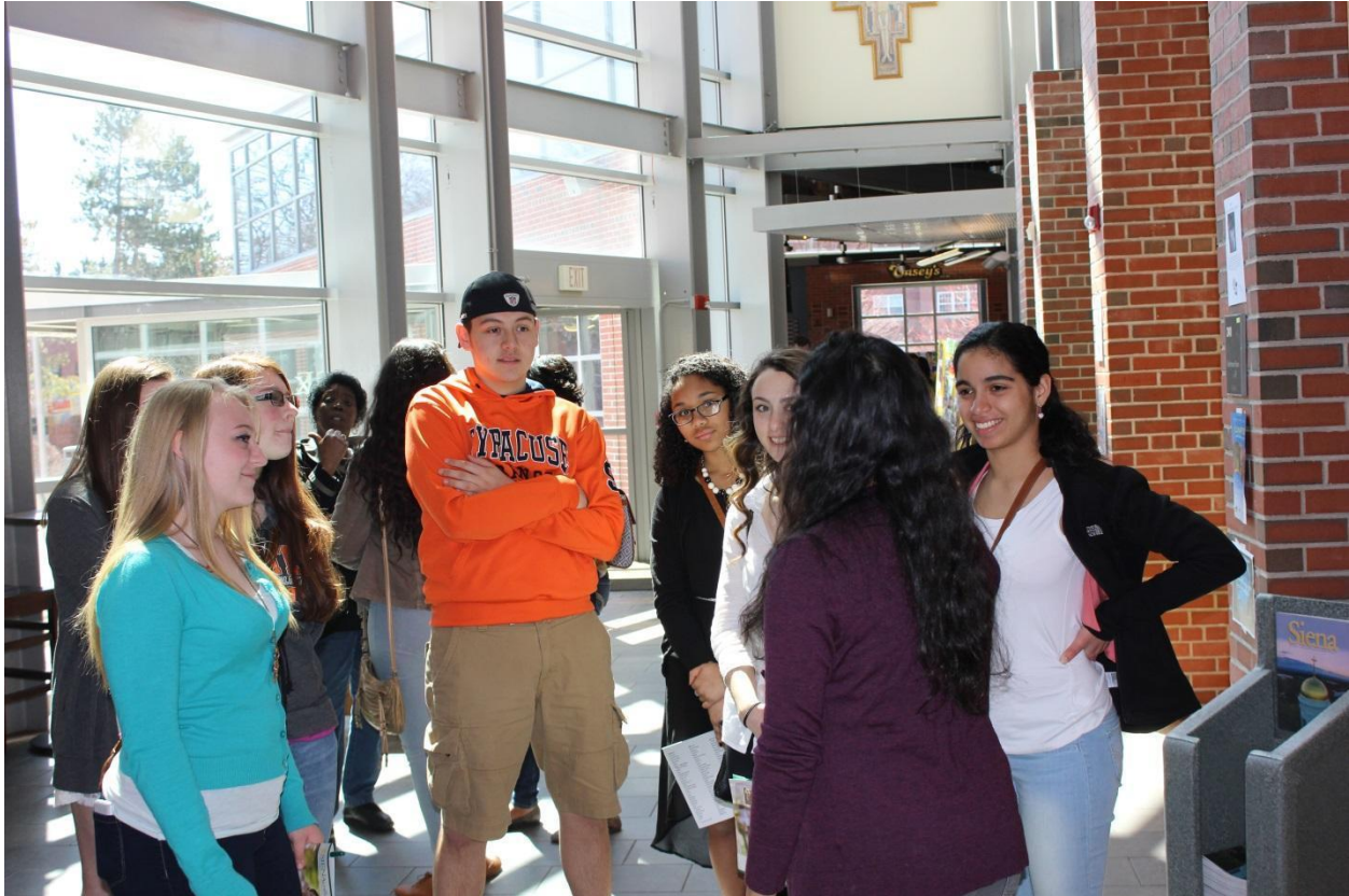
Siena College Tour 4/15/15