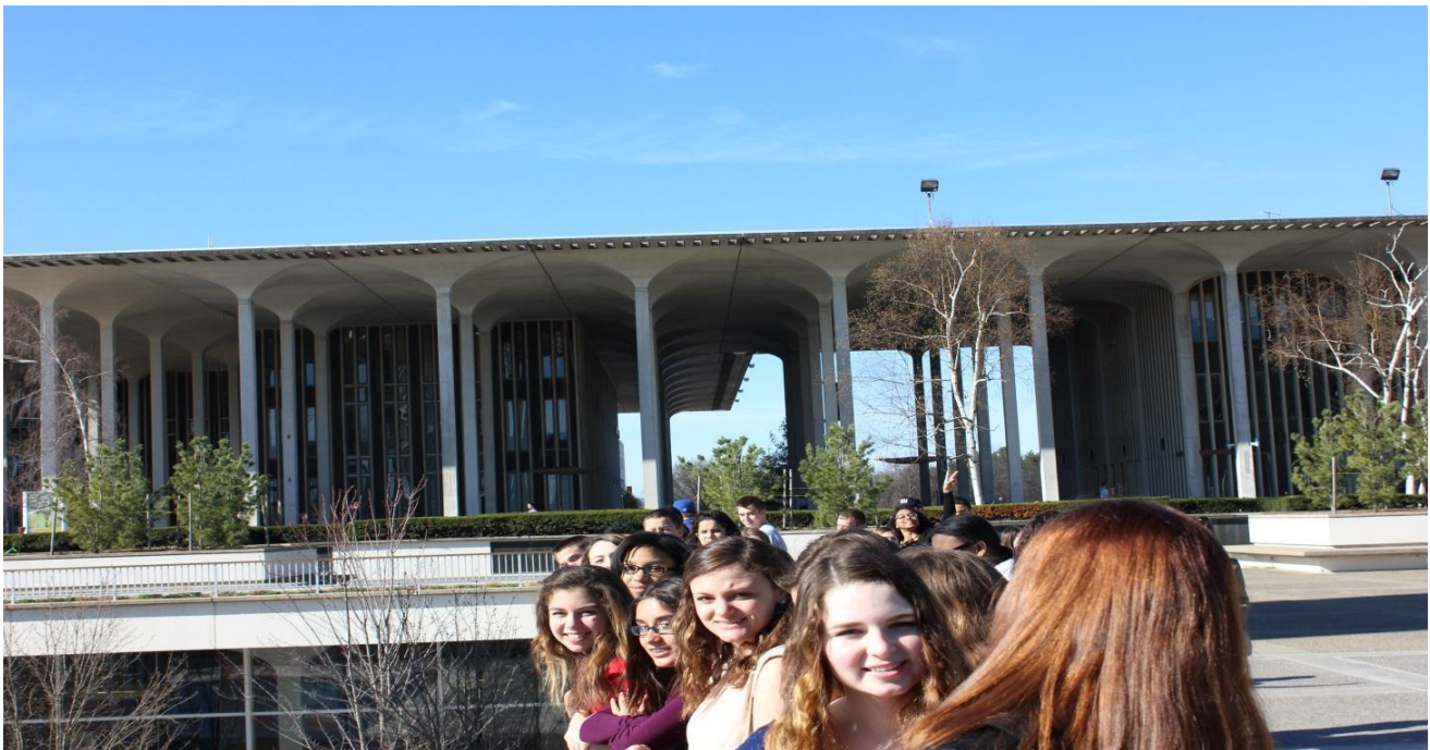
University at Albany College Tour 4/15/15

Standard A: Students will acquire the knowledge, attitudes and interpersonal skills to help them understand and respect self and others.