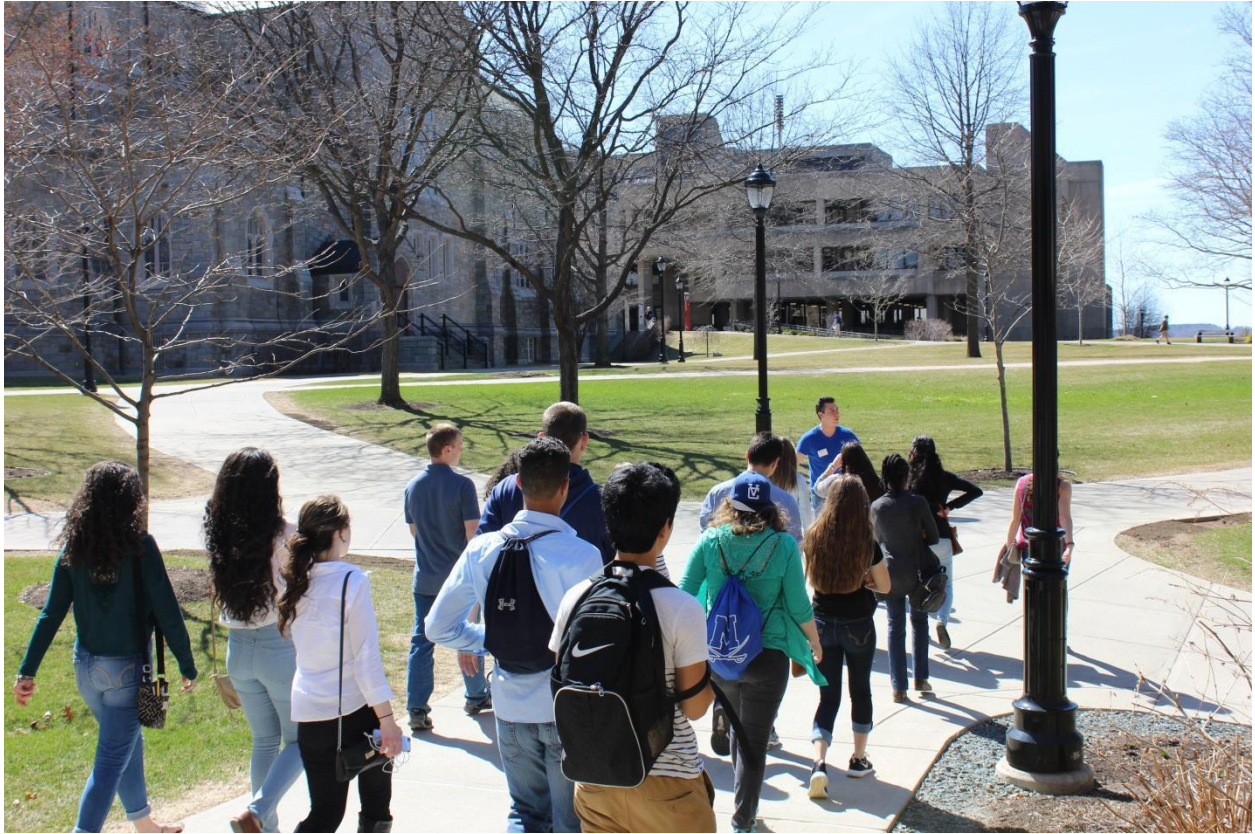
Rensselaer Polytechnic Institute College Tour 4/15/15