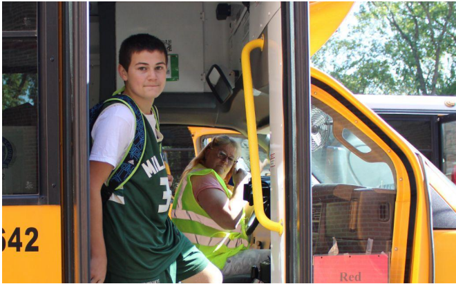
Students arriving at ALC Maybrook