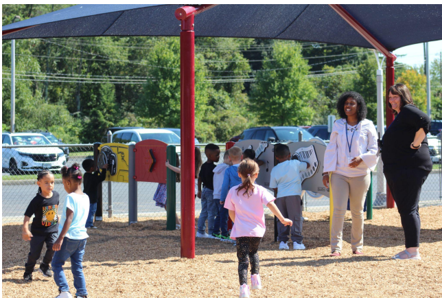
Berea Elementary students playing on the playground