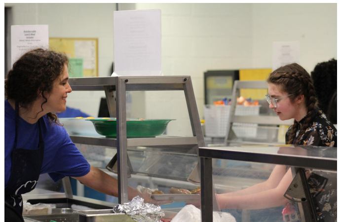
Middle School Students receiving hot lunch with a side of hospitality