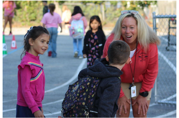
Students being greeted by staff at Walden Elementary School