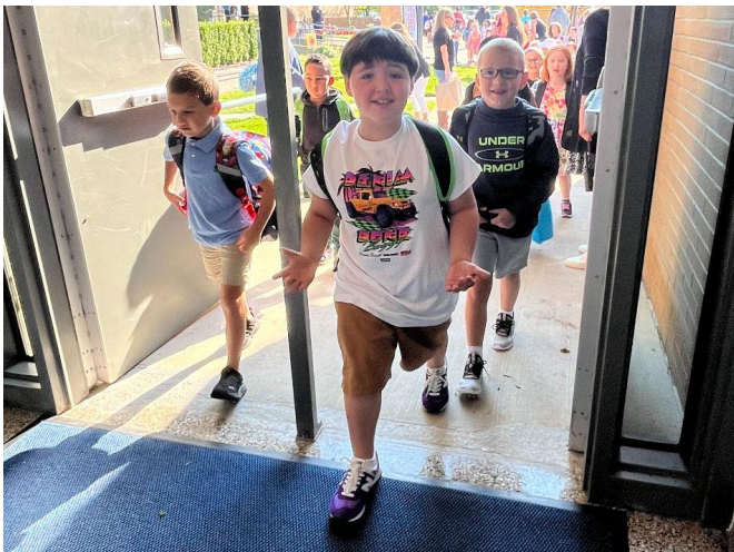
Students eagerly entering East Coldenham Elementary School