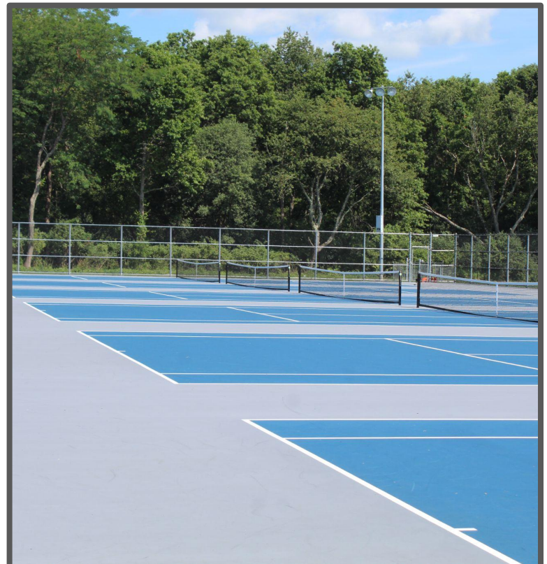
The High School tennis courts were resurfaced.