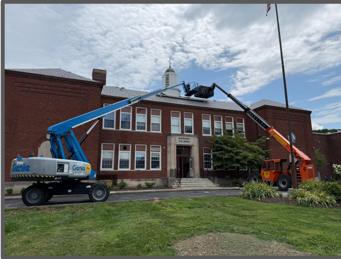
Montgomery Elementary School got a new roof.