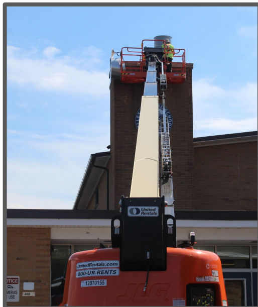
The chimney flue was relined as part of the boiler replacement at the High School.

Watch the 2025 Summer Construction Update Video .