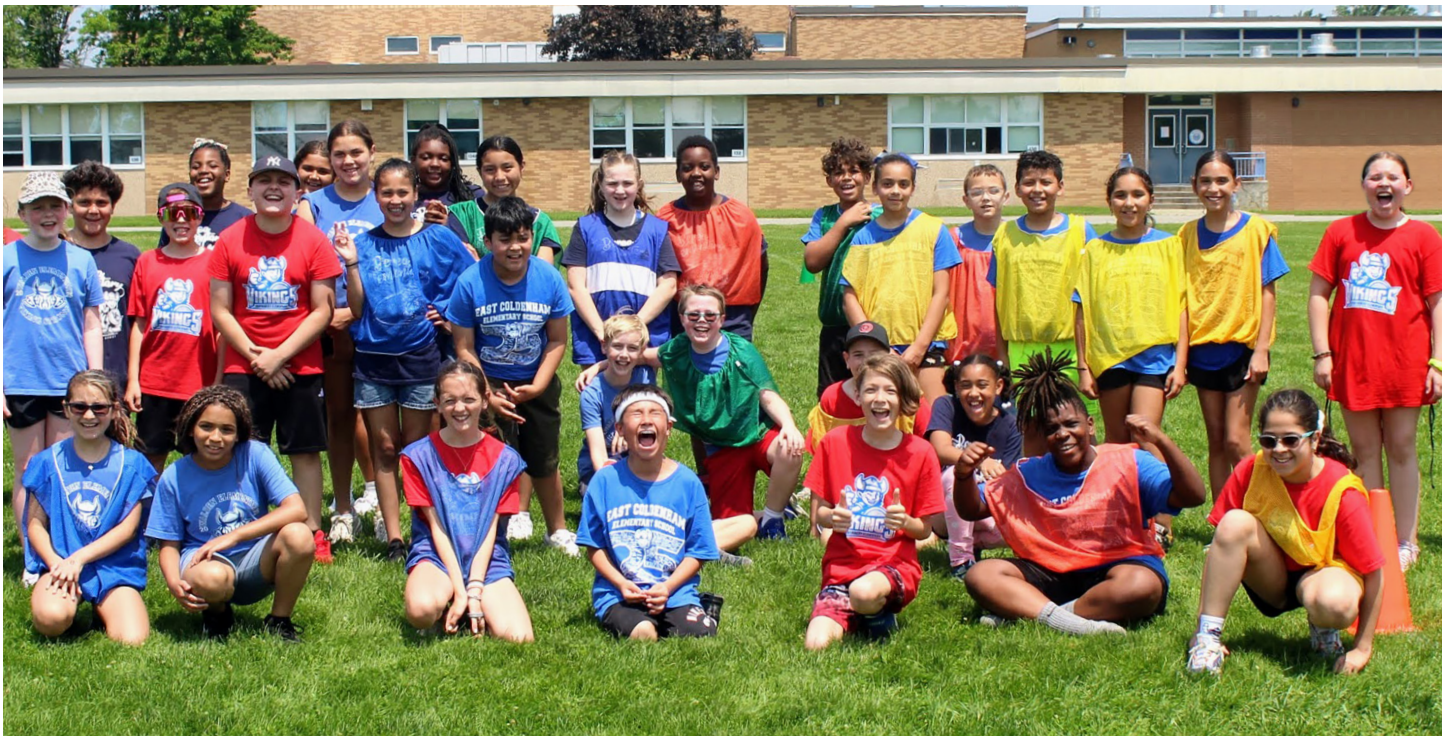
Students from our four elementary schools come together each year for Fifth Grade Field Day to play games and build a sense of community belonging before joining one another in middle school.